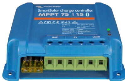
SmartSolar Charge Controller MPPT 75/15