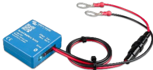
Bluetooth sensing Smart Battery Sense