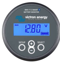
Bluetooth sensing BMV-712 Smart Battery Monitor