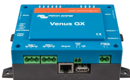
Venus GX front angle