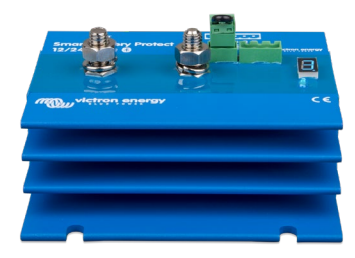
Smart BatteryProtect BP-220