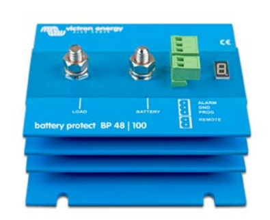
BatteryProtect BP 48-100