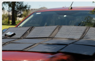
FLEXIBLE POSITIONING Lay flat or hang via corner eyelets for maximum solar positioning.