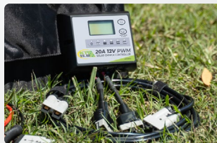
20A 12V PWM SOLAR CHARGE CONTROLLER Displays battery voltage, battery capacity percentage & amp hours.