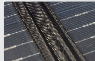
DURABLE STITCHING BETWEEN CELLS Designed for outdoor conditions.